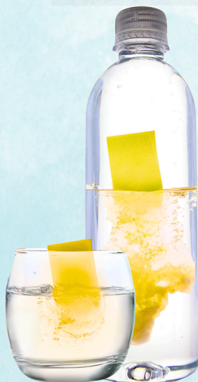
Molecular Health Electrolytes