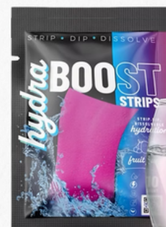
HydraBOOST Hydration Strips